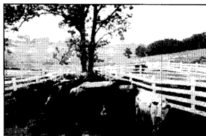
Beef cattle grazing